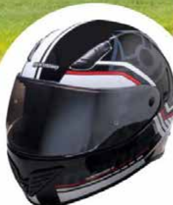
Text: Thomas Kryschan